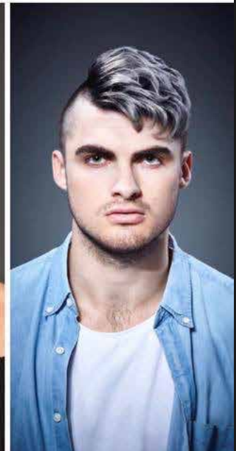
2017 Semi Finalists Essential Style